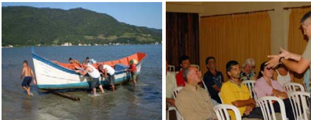
Members of AMPROSUL removing boat of the association and during the meetings.

AMPROSUL is composed of 27 members; it is located in Riberão da Ilha, in the south of the Santa Catarina's Island; AMPROSUL was founded in 2005 by a group of mussel producers and it has family characteristics. The predominant product in the activities of the association is the mussel Perna perna , better known in the region as marisco . Its production starts with the achievement of the seeds in the sea; they use proper collectors for that. The strong point which maintains these associates incorporated is the motto "... plant together..", in the sense that the associates meet themselves to install the collectors in water and, after some months, meet themselves again to withdraw the collectors and share the seeds.