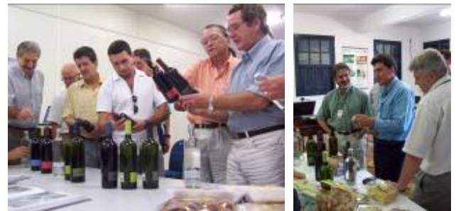
Presenting study and project in different localities where EPAGRI/SC is.

The localities attended and their products were Videira (wines), Chapecó (bread making), Urussanga (wines and cachaças), and São Miguel do Oeste (cachaças). The results obtained allowed to confirm that the development of a project of this nature is possible and gives to products of particular business graphical elements of identification and enable their correct recognition.