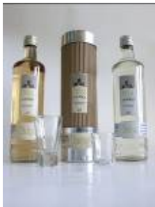
Meeting with producers. Labels and the "Premium" package. Group Beleza.

These results were fundamental to the maintenance of the partnership; it gave continuity to the projects, attending this time a family agroindustrial business located in Palma Sola, where we focused the product cachaça. By this project, it was verified that the proper partner (EPAGRI) did not have an appropriate identification of their own products, and, consequently, it became a bad example to all those producers who was seeking aid in it. About this, one of justifications presented at the beginning of this work remains: "... there is the understanding that there is not knowledge or apt professionals within the companies of the State to act in the area of Design attending farmers and agro-industrial businesses. The fact restricts to partner companies of the project. Thus, we started a project with EPAGRI aiming at the creation of a "family" of products that could be recognized in any place of the state as pertaining to them.