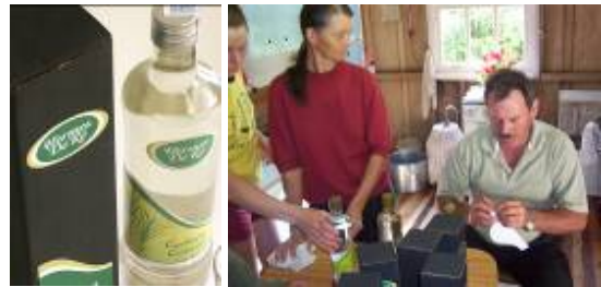
Meeting in the agroindustrial business in Palma Sola. Products and producers assembling packaging and labels.

The localities attended and their products were Videira (wines), Chapecó (bread making), Urussanga (wines and cachaças), and São Miguel do Oeste (cachaças). The results obtained allowed to confirm that the development of a project of this nature is possible and gives to products of particular business graphical elements of identification and enable their correct recognition.