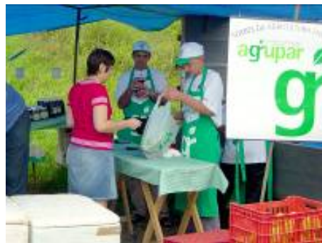
Fair dealers from Agropar in Canoinhas (SC), before and then.

A research of opinion on the apparent quality of new products was carried out in points of marketing in the localities of Canoinhas and Porto União. It is important to clarify that this research intended to verify the behavior of local consumers regarding the new appearance of the products, without trying to generalize. The results were considered satisfactory and were cited in the comment of one of the producers of Agropar: "... it has improved too much the sales and the recognition for us as farmers..." - Luna and Yamada[19]. In the case of the group in the locality of Itapiranga, called Beleza, it was very clear since the beginning the conscience of the producers about the need of improving the apparent quality of their products in order to improve, too, their commercial performance. The results showed positive ranks again with the developing of identification and labels, as well as a "premium" packaging for the product cachaça, which was very well accepted and recognized through the award received in the concourse Design Catarina MPE 2005. In this event, the