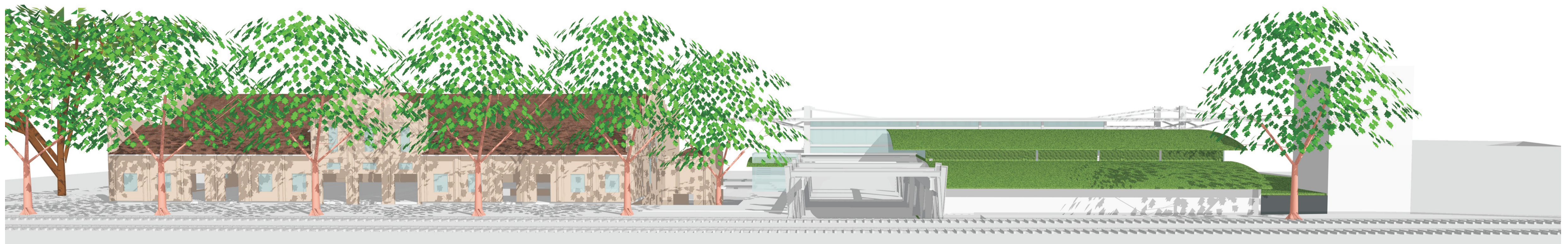
FACHADA LESTE escala 1:250