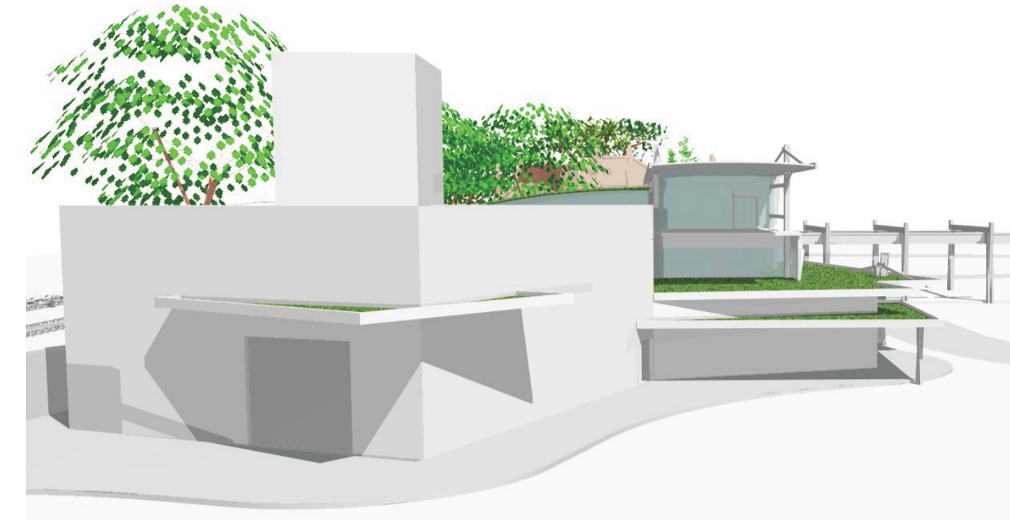
FACHADA NORTE escala 1:250