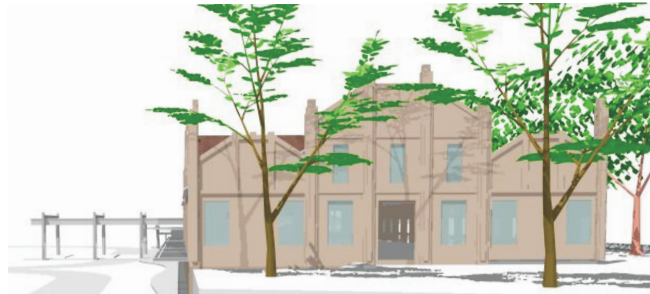
FACHADA SUL escala 1:250