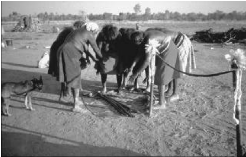
Photo 25: Mangaya sticks connected with the ritual makarra (womb) hair string rope aiming at bringing the dancers into the Dreaming space-time.

group traveled 2,250 kilometers to the north, as far as the Lajamanu Warlpiri, before returning in a ritual convoy totaling some 600 travelers upon arrival. Novice's travels are accompanied by transfers of ritual objects, slabs and hair strings, as well as marriage promises, the circumciser often being obliged to promise the novice one of his daughters. Similar convoys travel the east/west axis linking the Central and Western deserts to the Kimberley groups, as far as Broome. Interestingly, on this coast, boys and girls of marriageable age used to receive a hair string belt garnished with a large pearl-shell. Once this shell, inscribed with Dreaming signs, was transmitted to the desert groups, it became a sacred object reserved for initiated men, especially rain-makers.