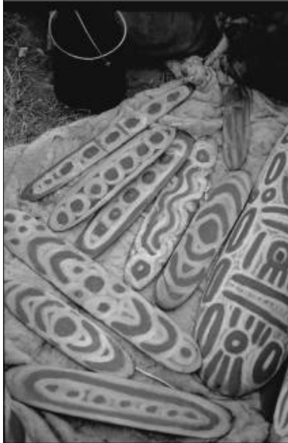
Photo 24: Warlpiri women's ritual slabs yukurrukurru , painted with designs corresponding to the Jurntu (Fire Dreaming) and Miya Miya (Seed Dreaming) sites.

in the group which shares the same totemic name: this singularity, which is named, drawn, sung and danced, dwells in people, places, totemic species and sacred objects; the Warlpiri and their neighbors in the desert call it Jukurrpa: the Dreaming (Glowczewski, 1991).